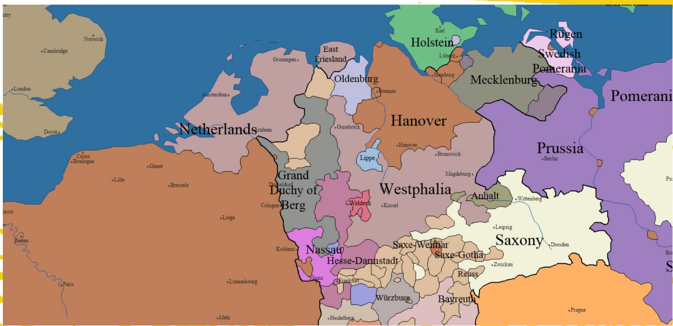
Map of Central Europe, 1810