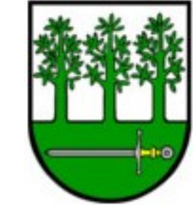
Town Crest of Nordwalde