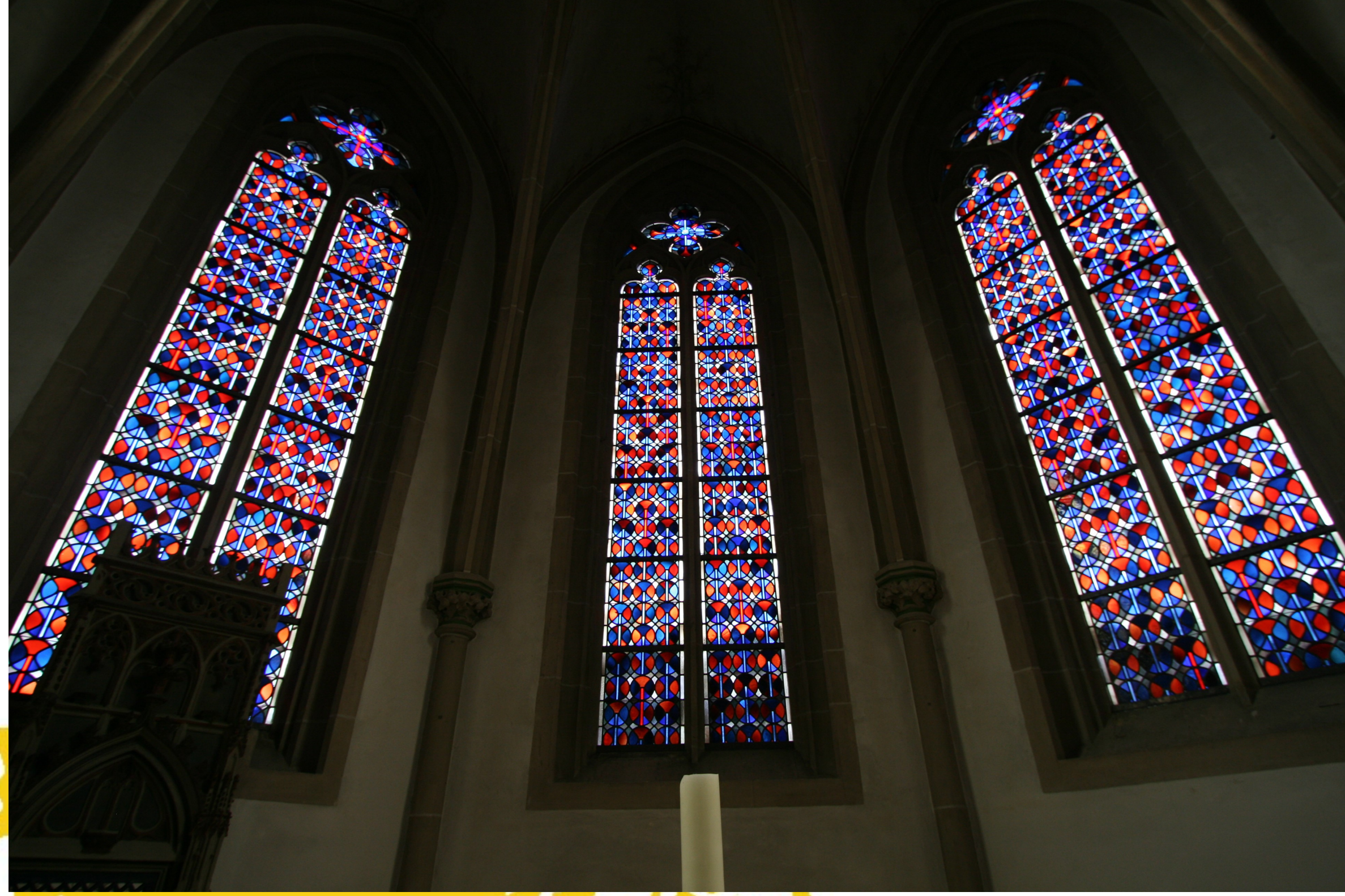
Stained Glass Windows in the Church of St. Dionysius, Nordwalde

This relationship was re-kindled in 2009, and remains as strong as it ever was.